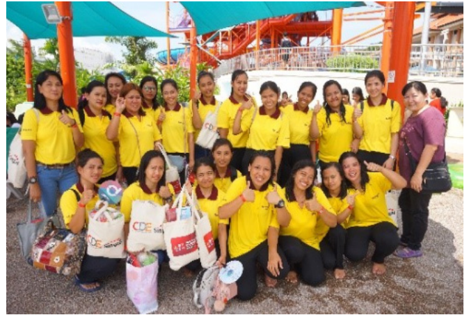
Figure 1: Nation FDWs having fun time at the Wild Wild Wet Waterpark at the May Day Domestic Employees Celebration 2019

For FY2020, the Group's target is to continue to have initiatives to build a better environment for FDWs and participate or contribute to more social events.